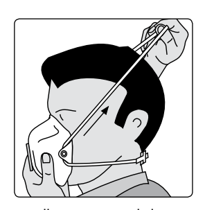
3. Pull upper strap and place on back of head.