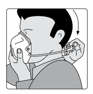
Place respirator on chin and pull loop over head tight to the neck.