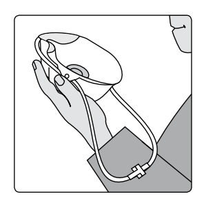
1. Pull strap to form a large loop.