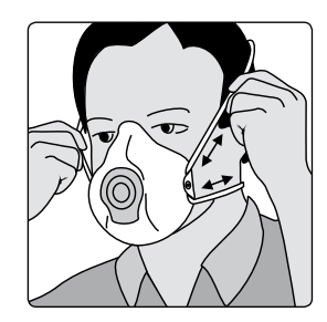
4. Adjust strap by pulling loop on strap.