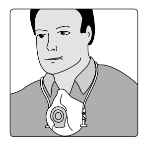
6. Let mask hang around your neck.