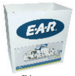
Dispenser Wall Mount